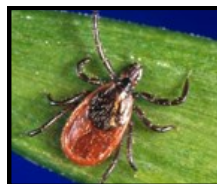
Black-legged/deer tick Found in Iowa