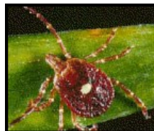
Lone star tick Found in Iowa