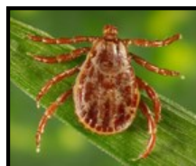
Rocky Mountain Wood Tick Not in Iowa