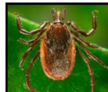
Western Black-legged tick Not in Iowa