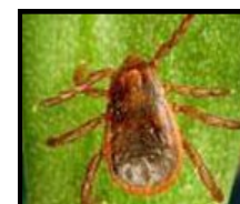
Brown dog tick Not commonly found in Iowa