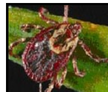
American dog tick Found in Iowa